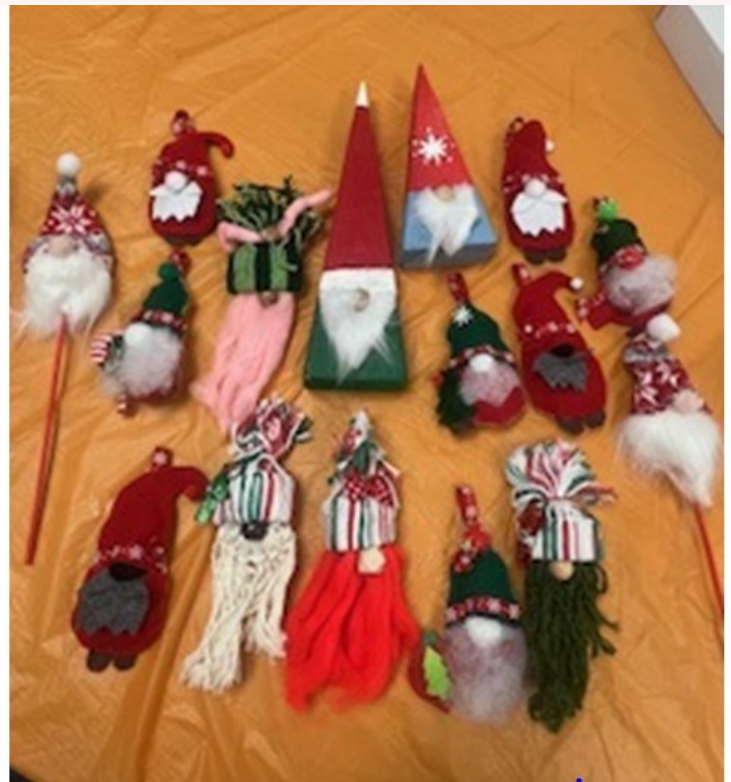
Christmas Gnomes are flooding the Senior Center. Can you find them all? When you do