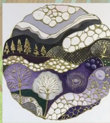
June 18 Hot Glue Painting