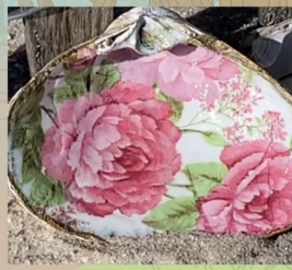
June 25th Decoupage Fun