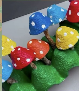
June 11th Egg Carton Mushrooms