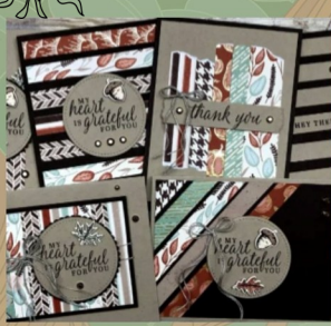
June 4th Father's Day Cards