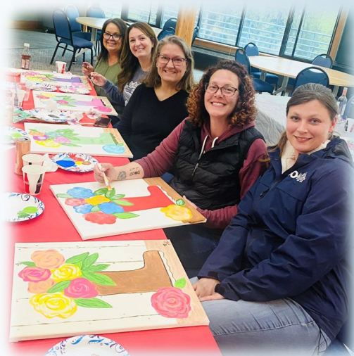
Such a fun group of Ladies.