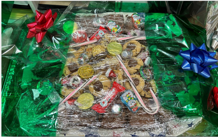
The American Legion and Auxiliary prepared and delivered a large amount of cookies and sweets for Christmas.