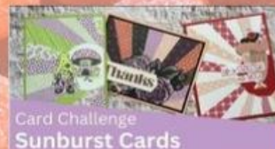
Card Challenge Sunburst Cards