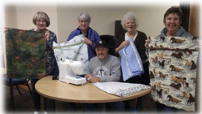
First Sewing Class 10/4/22!