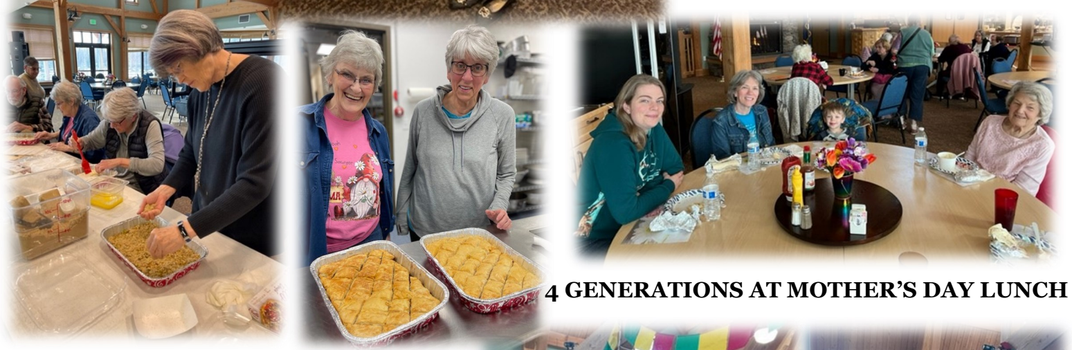
BAKLAVA WITH HALA